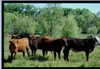
Well Cared for Cows